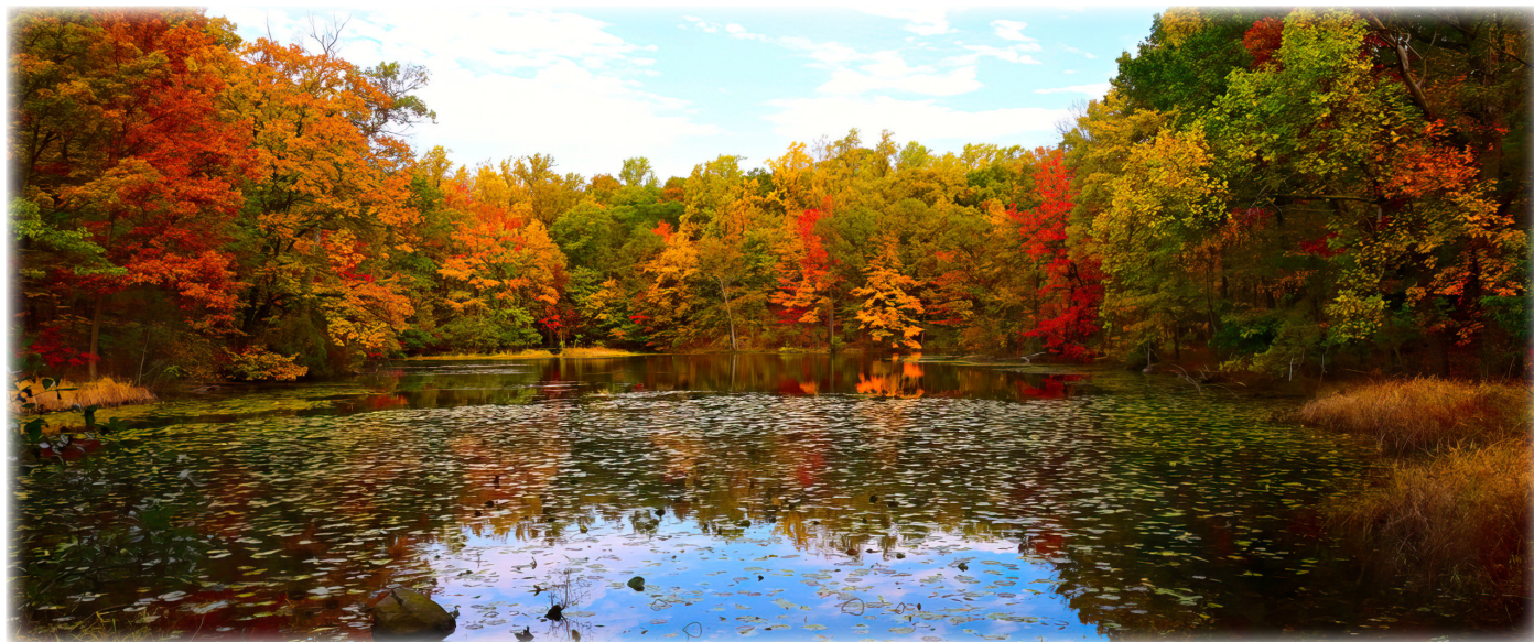
Greenbrook Pond in Autumn