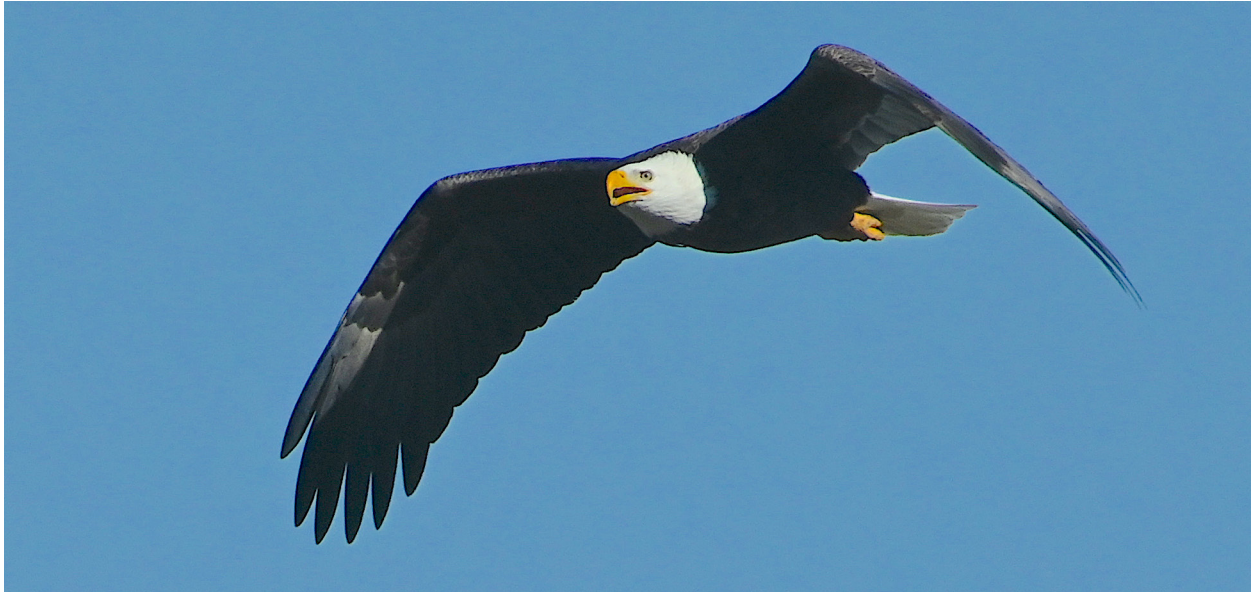
Bald Eagle in Flight