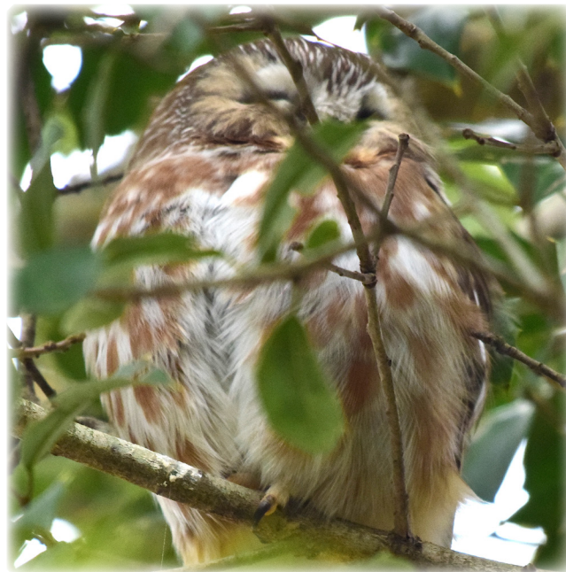
Northern Saw-whet Owl

Everyone please be aware that the parking lot in Greenbrook Sanctuary is frequently inhabited by two male Wild Turkeys. They can at times appear antagonistic and agitated. Most of the time they are harmless but as the weather gets warmer, they may become more aggressive. If they charge you, wave your hands up and down and yell loudly. This should make them back off. If you have any concerns or questions, please ask the Naturalist when at the Sanctuary or call 201-784-0484.