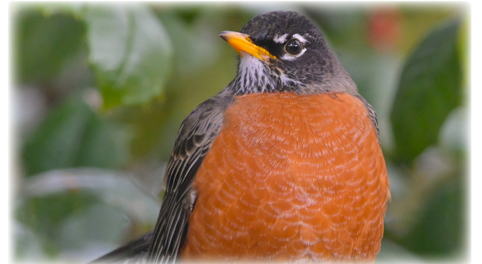
Robin amid the holly