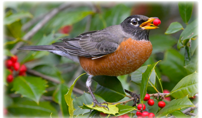
Robin with holly berry