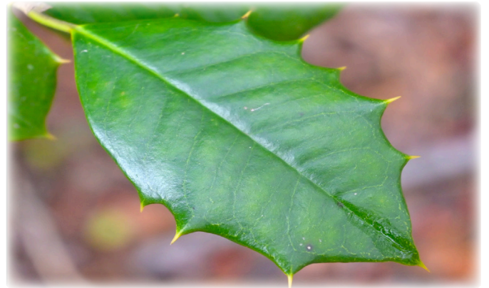
American Holly leaf