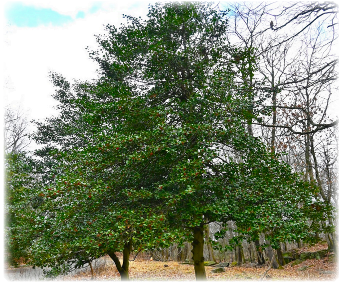
American holly